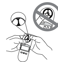
Replacing the Impeller

You may recalibrate the wind speed readings by replacing the impeller. Press FIRMLY on the sides of the black impeller housing with your thumbs to remove the entire assembly. When inserting the new impeller, be sure the arrow is facing the display side of the unit, and is aligned with the top of the meter. Press on the sides of the housing rather than the center.