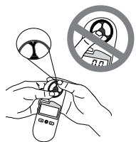
Replacing the Impeller

You may recalibrate the wind speed readings by replacing the impeller. Press FIRMLY on the sides of the black impeller housing with your thumbs to remove the entire assembly. When inserting the new impeller, be sure the arrow is facing the display side of the unit, and is aligned with the top of the meter. Press on the sides of the housing rather than the center.